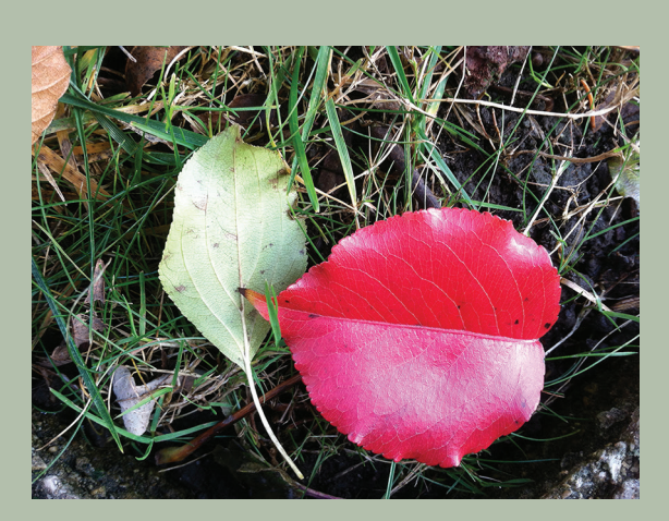
THE STARK BEAUTY OF NOVEMBER

We begin to bring light to darkness. Light one purple candle.