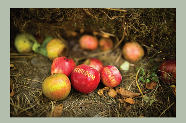
HEIRLOOM: AUTUMNAL MAGIC